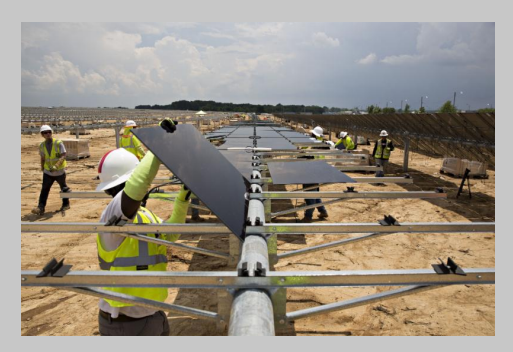
2050." LEARN MORE

"Wind and solar are set to surge to almost "50 by 50" – 50% of world generation by 2050 – on the back of precipitous reductions in cost, and the advent of cheaper and cheaper batteries that will enable electricity to be stored and discharged to meet shifts in demand and supply. Coal shrinks to just 11% of global electricity generation by